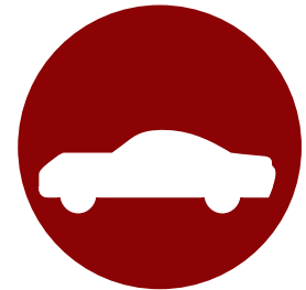
Motor Vehicle Accident