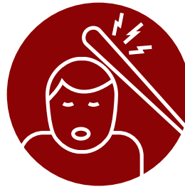
Struck by object